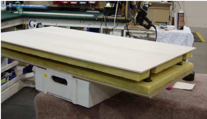
Fig 8: Completed diaphragm assembly