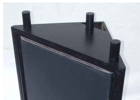
Fig 3: SpringTrap™ bottom revealing the primary port

Fig 2: SpringTrap™ cutaway view Notice the intermediate ported baffle and precision springs