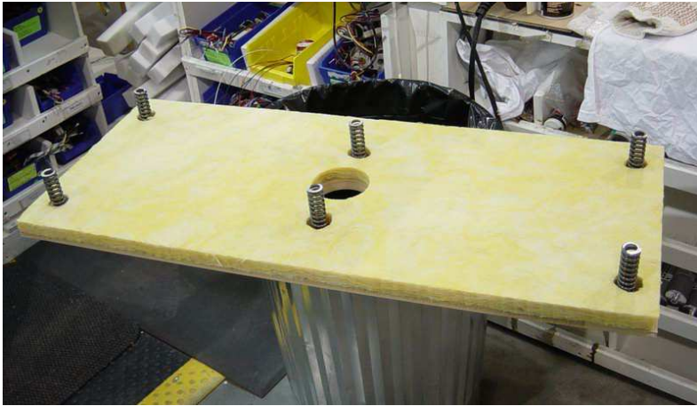
Fig 7: Intermediate plate with springs and stuffing