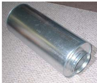
Figure 5: An inline duct silencer

The noise generated by the fans and the air rushing through ducts can be reduced by the use of duct silencers. Silencers can also reduce the sound bleed-through between rooms serviced by the same HVAC system.