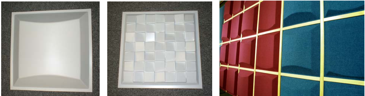
Figure 3: Sound scattering panels and example installation