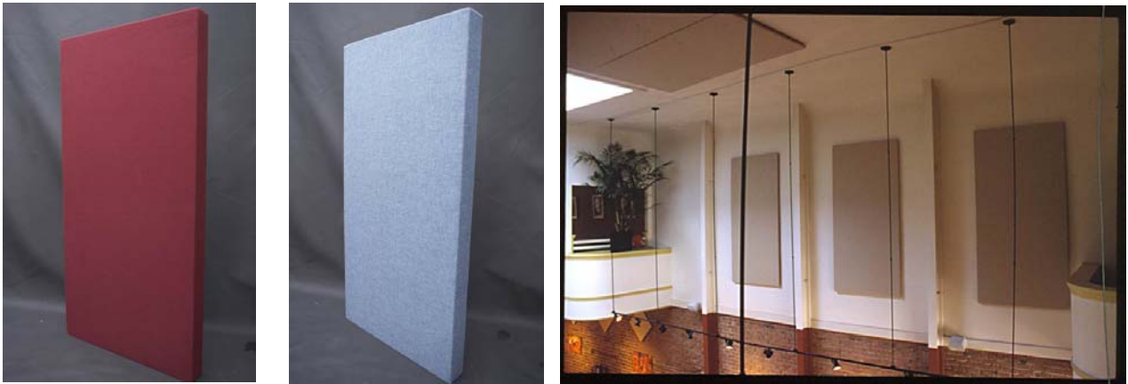
Figure 2: Sound absorbing panels and example installation