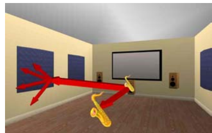
Scattering breaks up reflections.