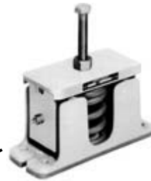
Figure 4: Air handler suspension system

The noise generated by the fans and the air rushing through ducts can be reduced by the use of duct silencers. Silencers can also reduce the sound bleed-through between rooms serviced by the same HVAC system.