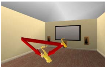
Sounds reflect off walls.

Sound reflections and echoes should be reduced and controlled. Absorption and scattering are two strategies for reducing echoes and reflections. In either case, the solutions consist of surface treatments applied to the walls.